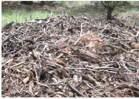
*IMPROPERLY STACKED pile