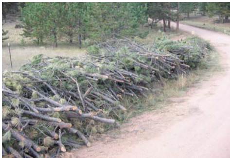
*PROPERLY STACKED pile